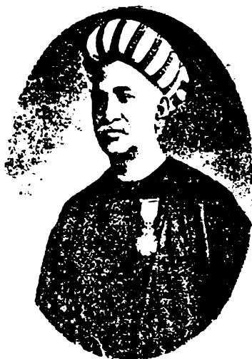
Rajendralal Mitra (1824-1991)