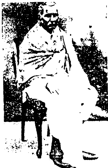
Hara Prasad Shastri (1853-1931)