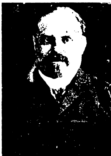
Hermann Oldenberg (1854-1920)