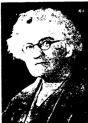
Mrs. C. A. F. Rhys Davids (1858-1942)