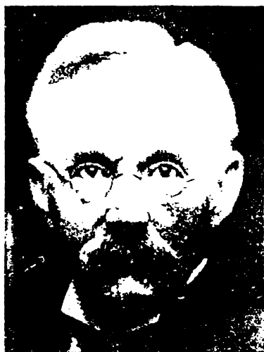
T.W. Rhys Davids (1843-1922)