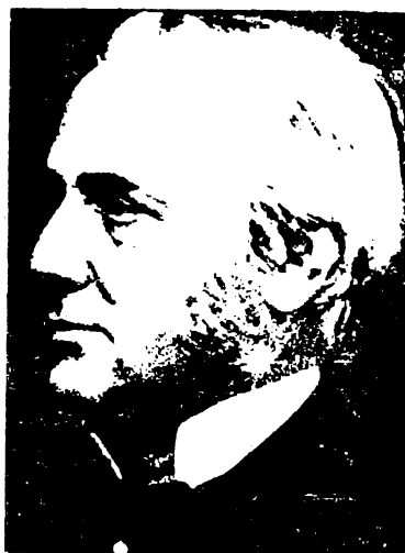
Friedrich Max Muller (1823-1900)