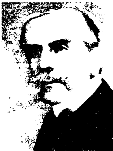
Emile Senart (1847-1928)