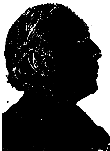
Anagarika Dharmapala (1864-1933)