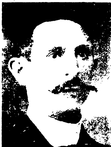
Louis de la Vallée Poussin (1869-1939)