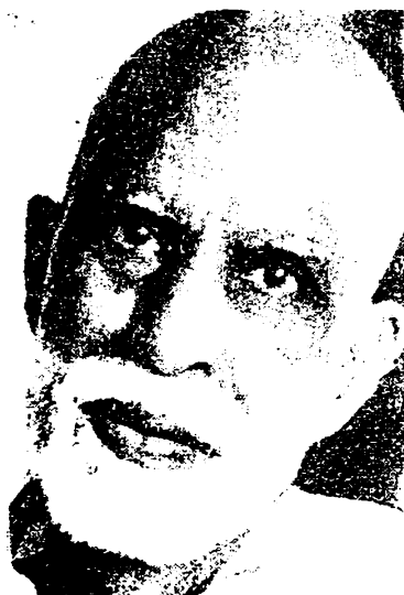
Dharmananda Kosambi (1871-1947)